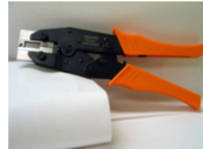
Figure 1: WTW-1293 Termination Tool